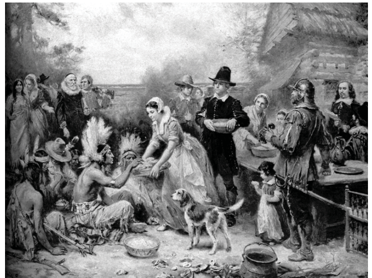
The first Thanksgiving, painting by Jean Louis Gerome Ferris (Reproduced from Wikipedia)

In the United States, certain kinds of food are traditionally served at Thanksgiving meals. First and foremost , turkey is usually the featured item on any Thanksgiving feast table (so much so that Thanksgiving is sometimes referred to as “Turkey Day”). Stuffing, mashed potatoes with gravy, sweet potatoes, cranberry sauce, maize, other fall vegetables, and pumpkin pie are commonly associated with Thanksgiving dinner. All of these primary dishes are actually native to the Americas or were introduced as a new food source to the Europeans when they arrived.