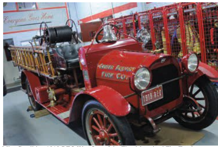
Mint Condition 1919 REO Was One of the First Motorized Fire Trucks

Members of the Fire Company are justly proud of their past and equally proud of the modern, well-trained fire, fire police and emergency response company that they have become.