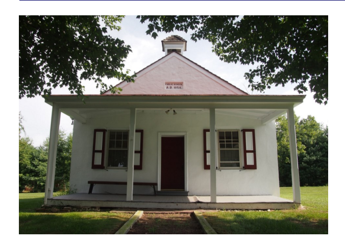
The Franklinville School (front view above) One-room-classroom (below)