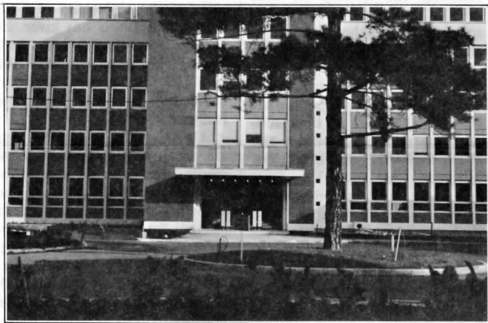
Facade of new office building of CFPI at Gennevilliers, France.