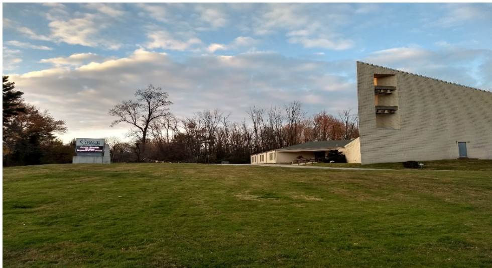
Whitpain's Grace Baptist Church, formerly the Baptist Temple on Broad Street