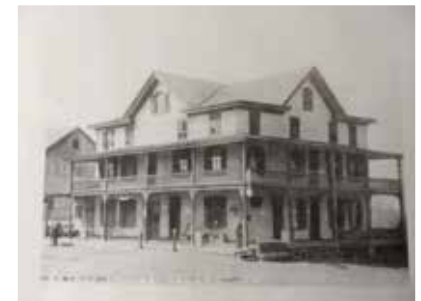
Hotel Centre Square, in about 1922 (from an old post card)