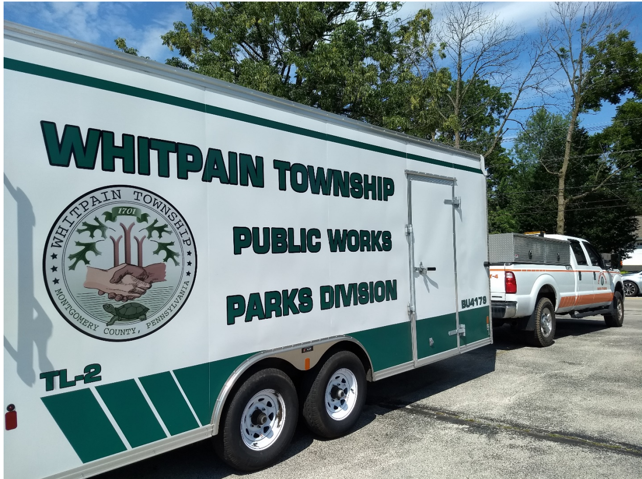
Whitpain Township, Preparing to Mow the 1895 Lawn