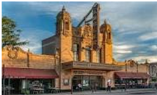
Ambler Theater, one of many Butler Avenue locations on the WVHS History Walking Tour

Tours will cover the historic buildings in downtown Ambler. You will be surprised what you have overlooked and what you will learn! Tour guides will define what Ambler’s buildings looked like before they were modernized, and the tour will take about 1 ½ hours to complete. (Perhaps plan a dinner afterwards at your favorite Ambler restaurant?) Tours will begin at the Ambler Train Station, near the former Bussinger model train store. Tours are free, but a donation is requested. You must register in advance, and registration details will be announced soon.