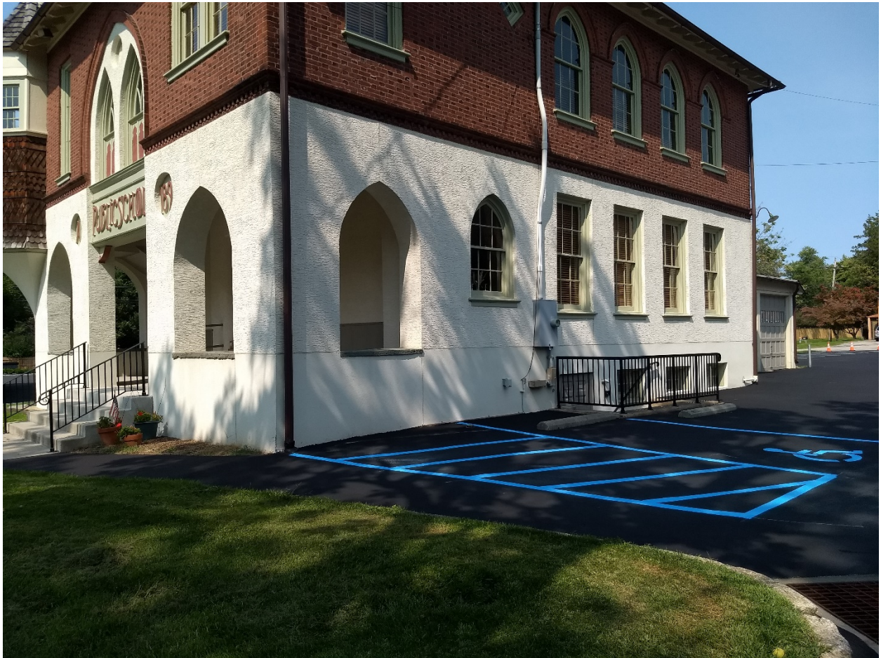
The newly sealed and painted parking lot at the 1895 Public School

“New” Parking Lot at the 1895 School: Thank you to Whitpain Township for giving us a smooth, safe parking lot to begin our society year! On September 16 th , workers spread sealcoating and re-lined the parking lot. Looks great!