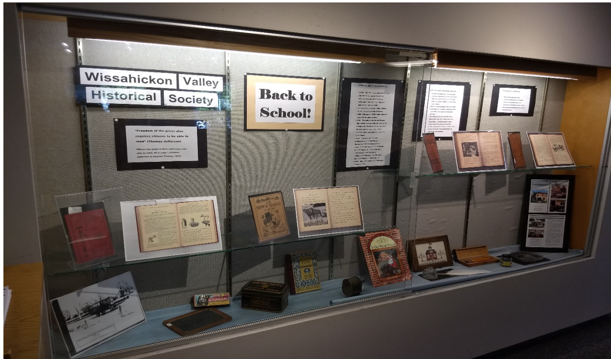
WVHS displays its textbooks, pencil boxes, and more at “Back to School” at the WVPL in Blue Bell.