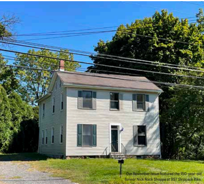
Our November issue featured the 150-year-old former Nick Nack Shoppe at 997 Skippack Pike.