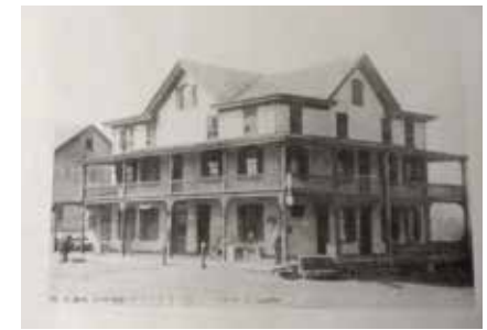
May's Around Town featured "Reed's Country Store," - A Revolutionary War Landmark. This photo is from a 1922 postcard, and depicts the structure as it was then, Hotel Centre Square.