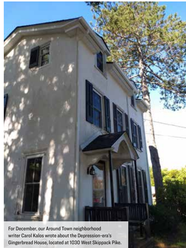
For December, our Around Town neighborhood writer Carol Kalos wrote about the Depression-era's Gingerbread House, located at 1030 West Skippack Pike.