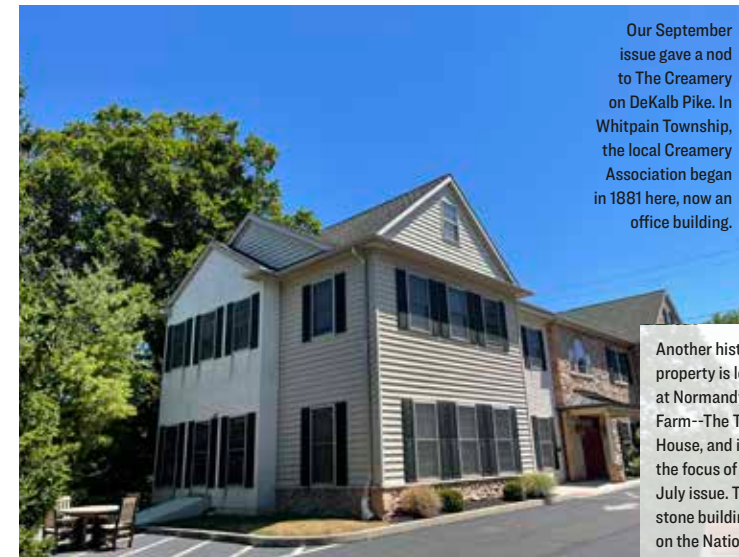
Our September issue gave a nod to The Creamery on DeKalb Pike. In Whippain Township, the local Creamery Association began in 1881 here, now an office building.