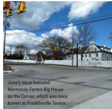
June's issue featured Normandy Farm's Big House on the Corner, which was once known as Franklinville Tavern.