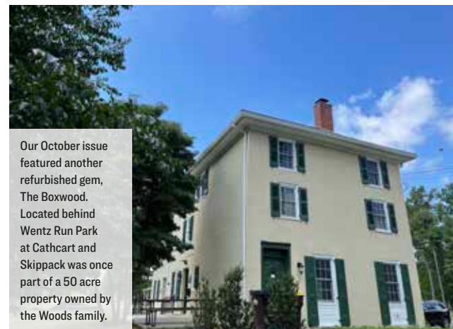
Our October issue featured another refurbished gem, The Boxwood. Located behind Wentz Run Park at Cathcart and Skippack was once part of a 50 acre property owned by the Woods family.