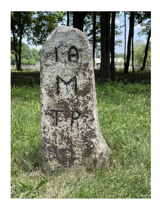
"18 Miles to Philadelphia," the milestone located on Morris Road