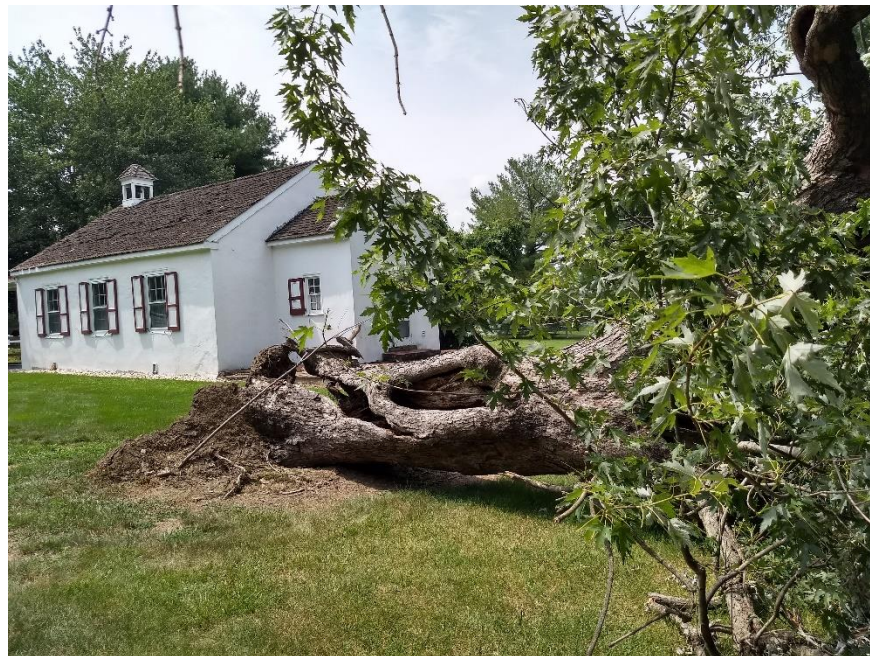
Fallen Silver Maple at the Franklinville School, August 2023

Fallen Tree at Franklinville School: Sadly, an old Silver Maple tree has died, toppling into the neighbors' trees. The trunk is hollow and has been leaning for years. The Board of Directors has hired an arborist to remove the tree and complete additional tree trimming at the property.