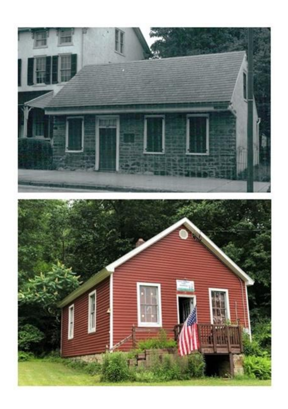
Back to School -- from PA SHPO (Sept 8, 2023)