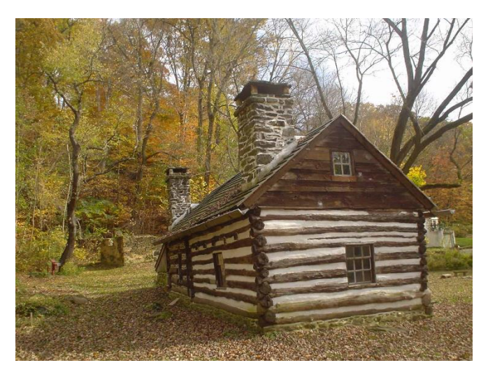
Oldest House in Pennsylvania, pictured in a lovely fall scene

National Register of Historic Places Is Misunderstood: The National Conference of State Historic Preservation Officers has issued a report on how we recognize our historic places, with attention on the National Register of Historic Places (NRHP). NRHP is often misunderstood and has not been widely used to recognize places of importance to many Americans whose history, sites, buildings, and neighborhoods may have been intentionally or unintentionally overlooked or not considered. Read the report.