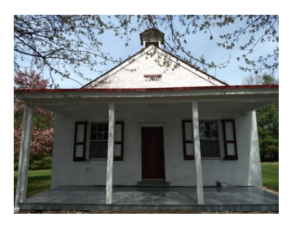
The Franklinville School. Photo taken in April, 2023

Sunday, Oct 8, 1-3PM, Franklinville School Open House. 1701 Morris Road near Normandy Farm (Oct.15 rain date): This one-room school, proudly owned by WVHS, will be open for the first time since the pandemic and construction issues closed its doors. Now it boasts a lovely, repaired, front porch. Furnished as a 19<sup>th</sup>-century classroom, the building appears on the National Register of Historic Places, not just because it is old (1858), but because it was once an important neighborhood center. Learn more about how thousands of local residents traveled to enjoy its community picnics! (Park on the lawn. Please enter through the white rail fence and park to the <u>right</u>. Due to parking issues, if the lawn is wet, the event will be postponed until Sunday, October 15.)