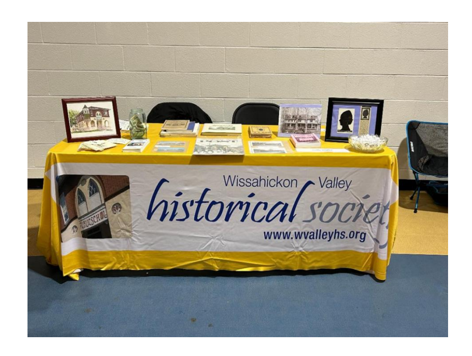
WVHS table at the Lower Gwynedd's First Indoor Fall Fest

the wonders of our local history. (Ambler's event, Oct. 7, is mentioned above.) The visitors ask questions or, better yet, offer information about local history not available in any book. This year, because of the rain, Lower Gwynedd's festivities were moved inside to the Wissahickon High School. Despite the quick change of location, the event ran smoothly.