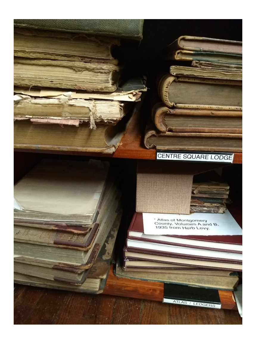
At the WVHS Library's Archives, some of the old books, soon to be stored properly

moisture. Among those books are 1900s scrapbooks and initiation records from the local Odd Fellows Lodge, especially interesting since they list each candidate's occupation. More archive boxes are needed to preserve fabrics, such as the three miliary uniforms contributed last year. These large boxes cost over $50 each! For more details or to donate, please email to <a href="mailto:info@WValleyHS.org">info@WValleyHS.org</a>.