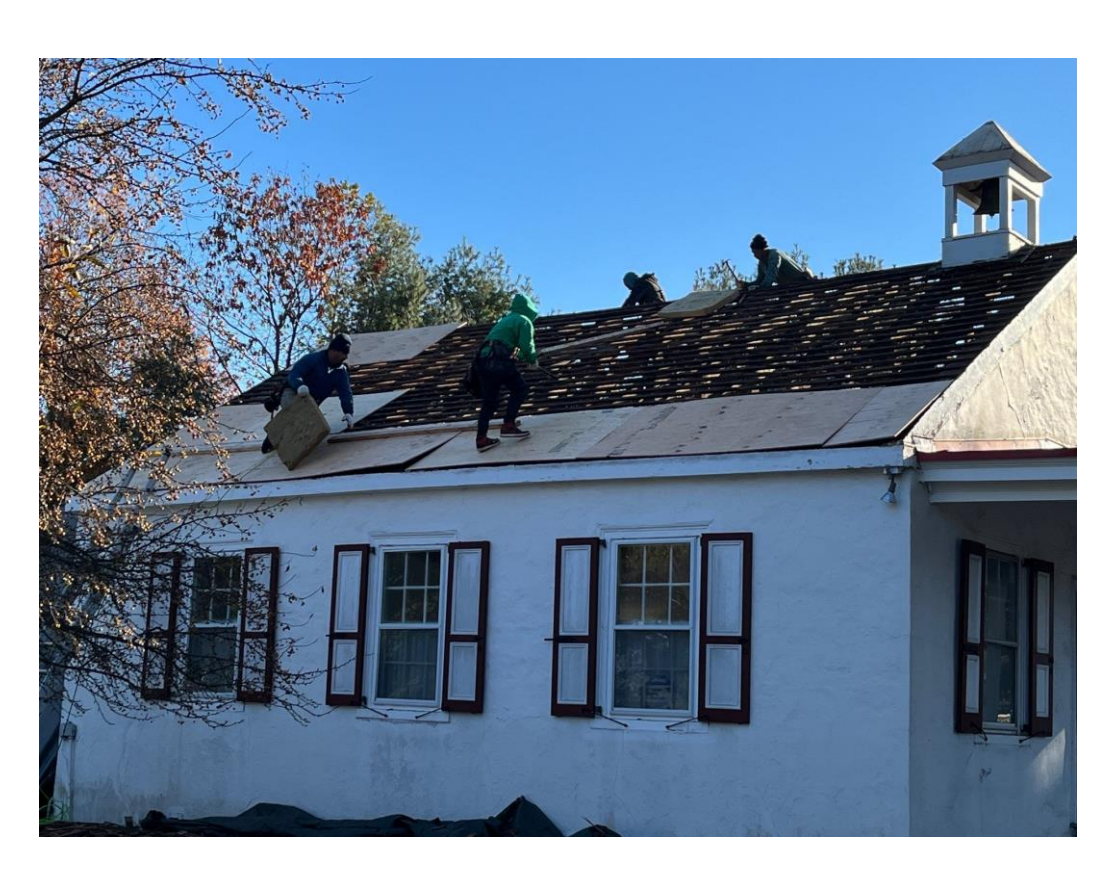
A New Roof Replaces a Leaking Roof at Franklinville School, November 2023

Members Give Franklinville School A New Roof: On November, Russell Roofing removed the leaking roof at the 1858 Franklinville School and replaced it with a fine, new roof. Asphalt shingles replaced the old, curling, cedar shingles because the replacement materials cost WVHS half as much and will last twice as long as a cedar roof. The change does not affect the status of the NRHP; the building looks the same. The funds for the new roof came from contributions from our members and the community, accumulated by years of saving. Other repairs made earlier in the year (a new front porch with a new roof) were paid for through a Pennsylvania grant. The school still needs a new back porch and painting, inside and out.