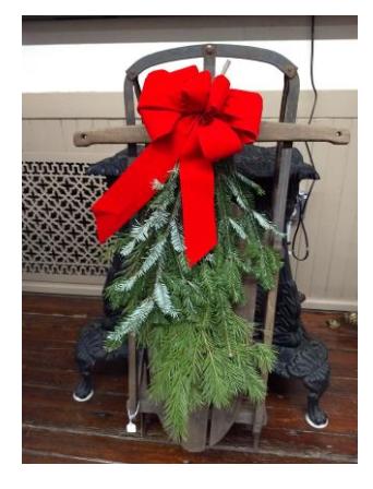
An antique sled at the 1895 School