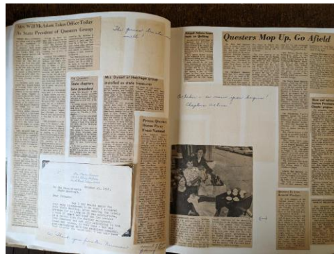
A sample page from a Questers scrapbook with personal notes and newspaper clippings

is “dedicated to promoting education, history, antiques, and the preservation of historic sites and artifacts.” The scrapbooks contain newspaper clippings and homemade greeting cards. Over the years, local Quester groups have generously donated to WVHS, providing funding for special exhibits.