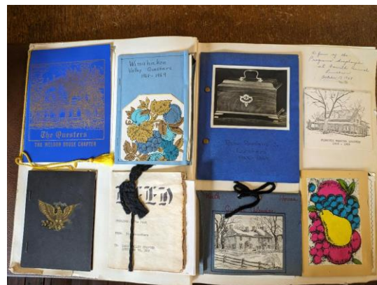
A page from the 1960s Questers Scrapbook, showing hand-made greeting cards