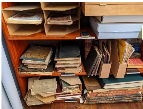
Early 1900s books in the WVHS Library, now housed in archival boxes

Home-School Coop: A group of 18 home-schooled students, grades K-3, meet weekly at Temple University Ambler. With WVHS’s direction, the group’s leadership will prepare a curriculum with fun experiences, designed to teach students about the WVHS collection, how a museum works, and local history. WVHS and the parents will design “lesson plans,” and the program will begin in academic year 2024-2025.