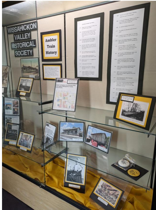
The WVHS display at the Ambler Library, February 2024, showing the history of the Ambler Railroad Station

February WVHS Display at Ambler Library: It illustrated the history of the Ambler Train Station, featured old photographs of train station structures, and included a timeline of the railroad's development.