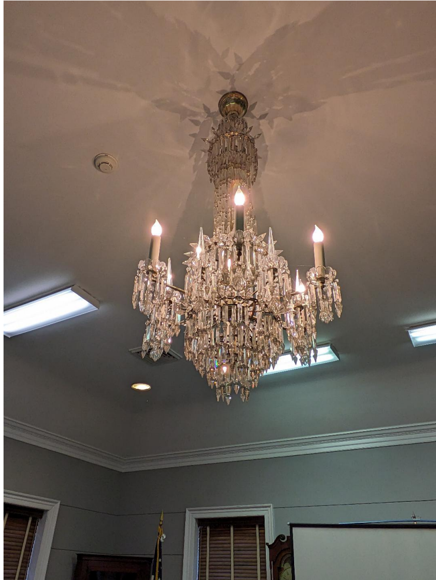
A Chandelier at the Historical Society of Montgomery County, originally from a Norristown home (February 2024)

Historical Society of Montgomery County to discuss the mechanics of hanging our WVHS framed pieces without damaging our historic structure.