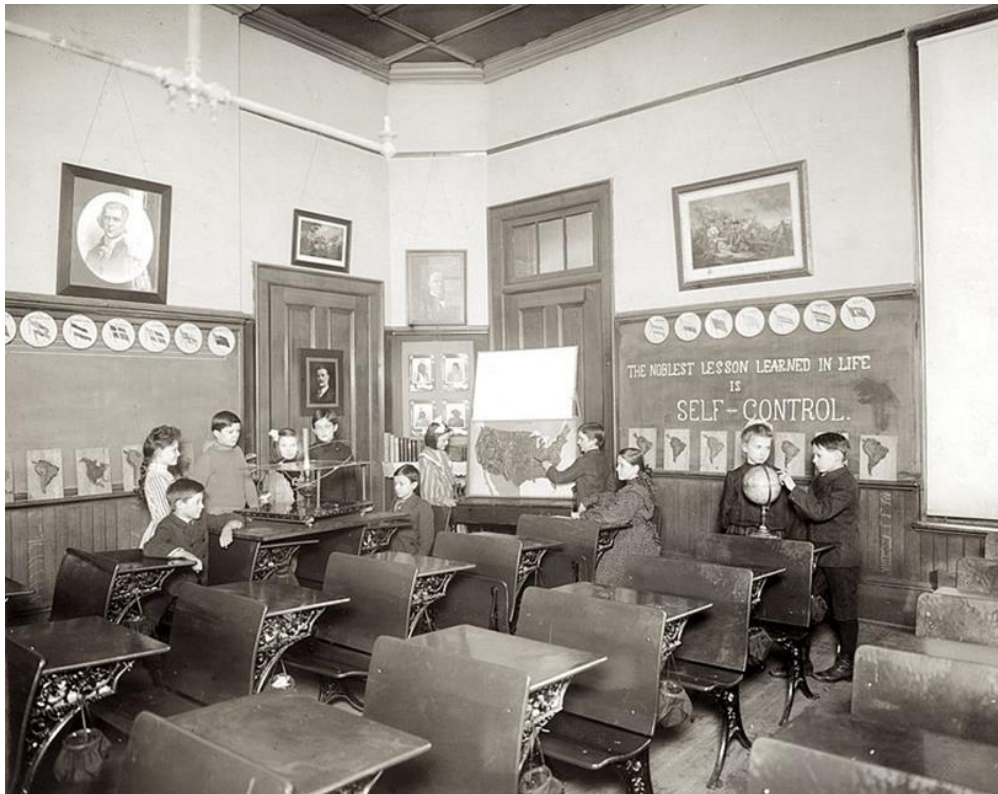
St. Louis Public Schools classroom exhibit in the Palace of Education at the 1904 World's Fair.