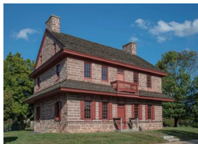
Henry Muhlenberg's House