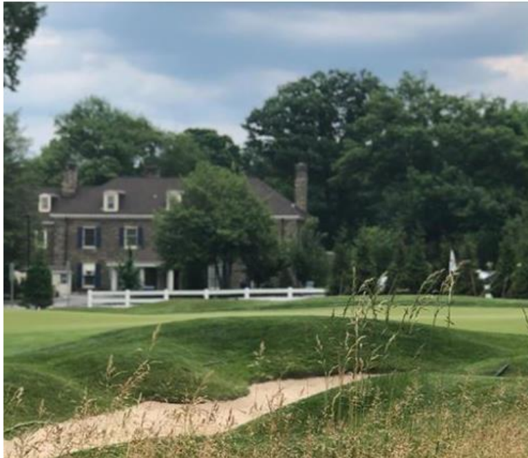
Bluestone Country Club (Web Photo)

https://yenh77.wixsite.com/wissvalleyhistorian/post/before-there-was-the-bluestone-country-club .