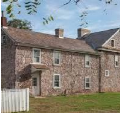
The Speaker's House