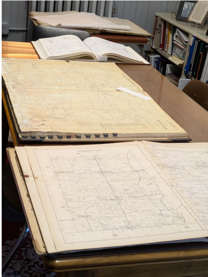
Old Map Books, Showing Sections of Ambler Borough, Whitpain Township, and Lower Gwynedd Township, on Display for the WVHS Picnic