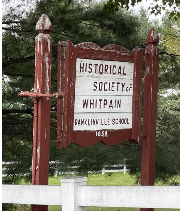
The 1980s sign in the fall of 2023, prior to being restored