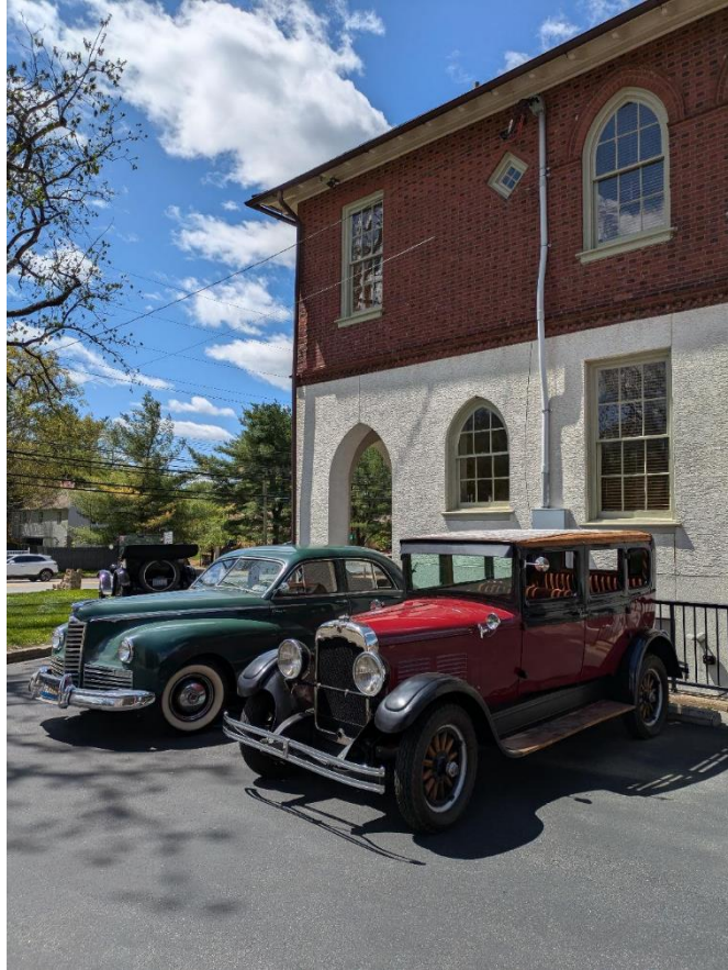
Antique Cars on Display at the Open House