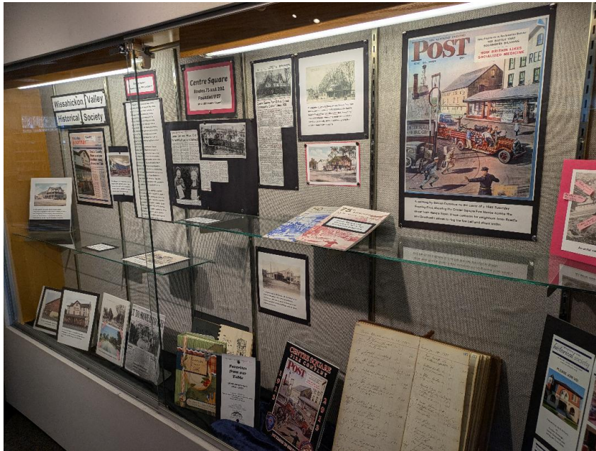
April's display at the Blue Bell Library featured the history of Centre Square.