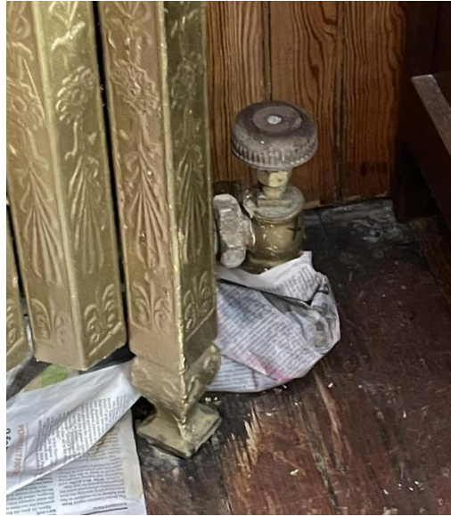
Damp newspaper reveals a water leak at the radiator valve, quickly repaired by Whitpain Township.

Interested in Old Shutters? Four old shutters with some rotting wood were removed from the Franklinville School and are available for sale. For details or to make an offer, please email: Info@WValleyHS.org