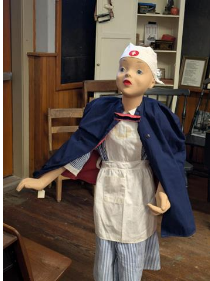
Child's nurse costume, worn by the newly-repaired mannequin