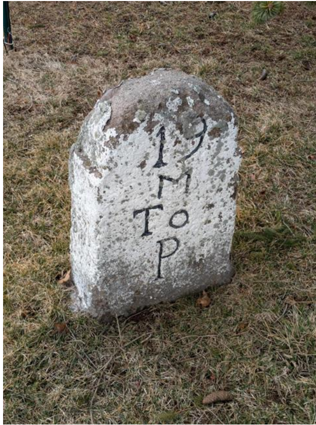
Colonial-era Mile Marker, located at St. John Lutheran Church, at 1802 Skippack Pike: “19 Miles to Philadelphia” (Photo from April 2025)

the church. A coincidence: The Mile Marker in the clipping is the same Mile Marker featured in the April 2025 Valley Crier , pictured below.