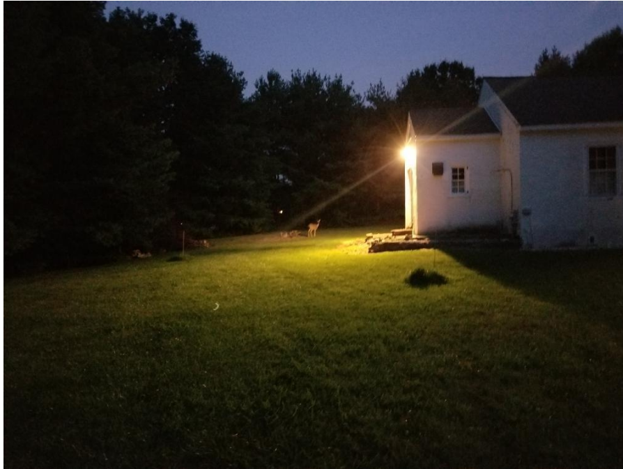
August 6, 2025, at the Franklinville School. See the deer?

the site. Remnants of a well and an outhouse are capped and surrounded by fencing.