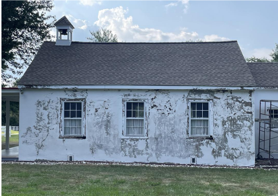
The side of the Franklinville School after loose stucco was removed, August 18, 2025