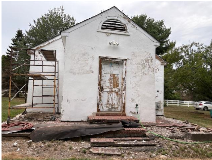
The back of the Franklinville School, prepared for painting, August 13, 2025