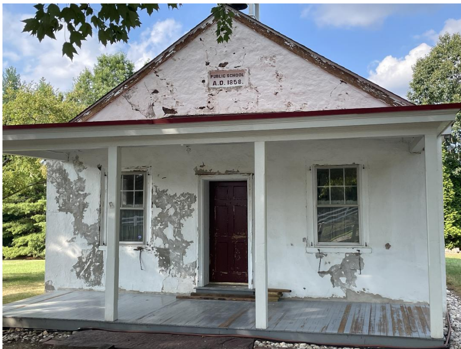
The front of the Franklinville School, water blasted in August 2025