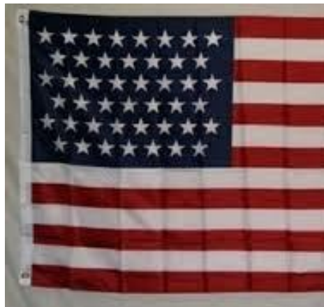
1896 US Flag

A WVHS Legacy Project to Mark America250 : In about nine months, the United States will celebrate its 250th year. Around the country, civil groups and historical societies like ours will mark the occasion by contributing to their communities or sponsoring events. WVHS has investigated several ideas, concluding that it will display its 1896 American flag at the 1895 School in the second-floor classroom--with a dedication to take place in 2026. The estimate to frame the treasured item is $1800, and funds are being sought. For more information, please email to Info@WValleyHS.org .