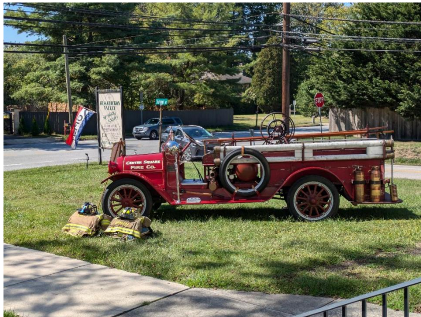
Centre Square Fire Company's 1919 REO Speed Wagon, recently honored as the oldest in PA, at the 1895 Open House,