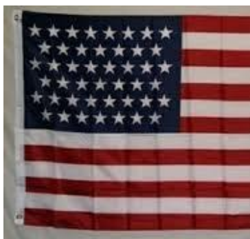
1896 US Flag with 45 Stars

A WVHS Legacy Project to Mark America250 : In about nine months, the United States will celebrate its 250th year. Around the country, civil groups and historical societies like ours will mark the occasion by contributing to their communities or sponsoring events. WVHS has investigated several ideas, concluding that it will display its 1896 American flag (for the first time) at the 1895 School in its second-floor classroom--with a dedication to take place in 2026. The 1896 flag (in use until 1908) would have flown at the school, which was dedicated in November of 1895. The 1896 flag with 45 stars marked the admission of the state of Utah. The estimate to frame the treasured item is $1800, and funds are being sought. For more information or to donate, please email to Info@WValleyHS.org .