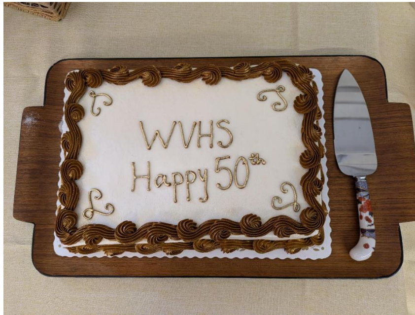
Cake to celebrate!