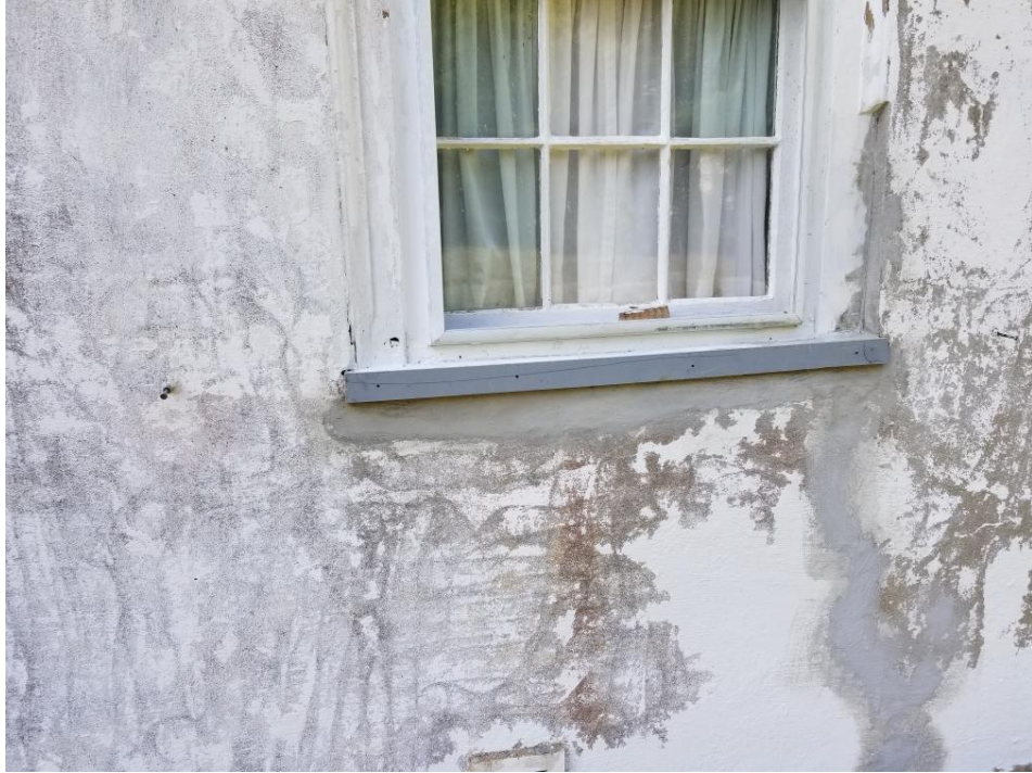
This new windowsill with “old” wood will hold the weight of the shutters