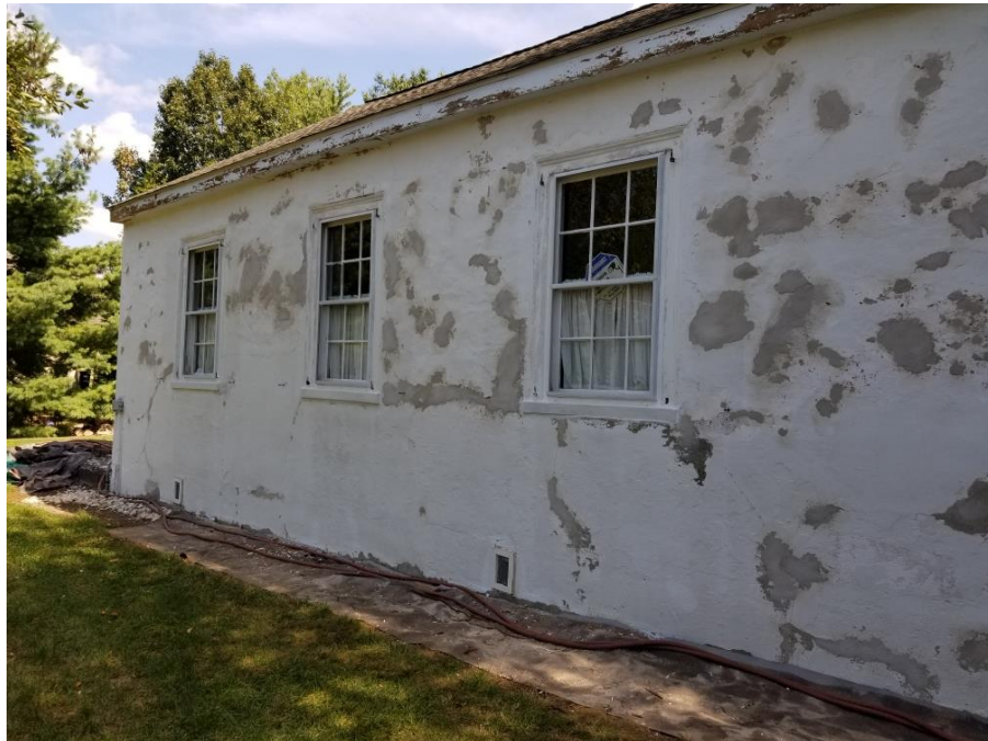
Joan Duxbury's photo from Sept 14 with windows glazed and the windowsills repaired and primed