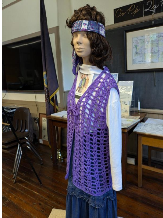
1970s Long, Crocheted Vest to Reflect the WVHS's Start in 1975