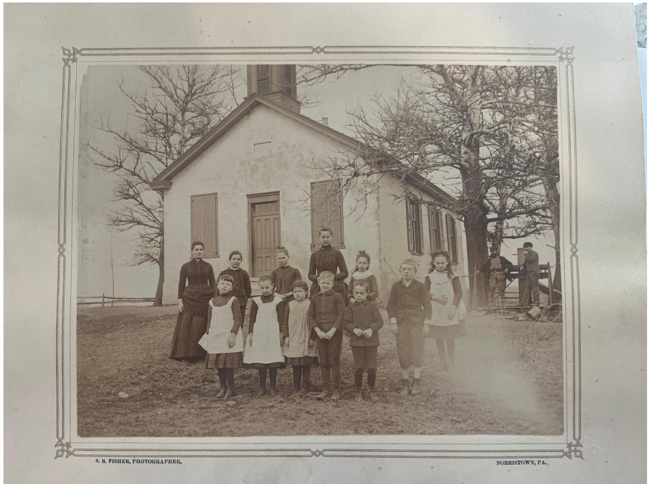
Franklinville School, taken in 1885-1890