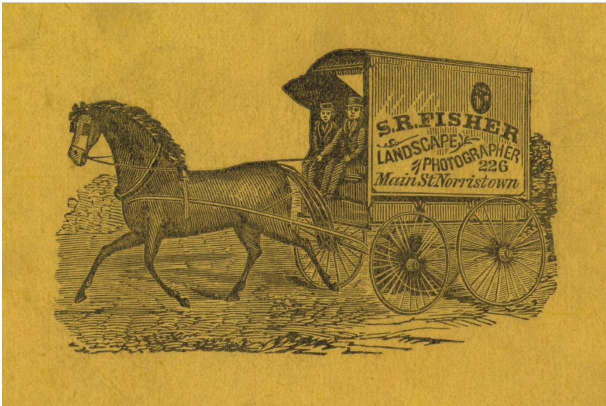
The photographer's ad: Reverse side of a stereograph, "S.R. Fisher..."