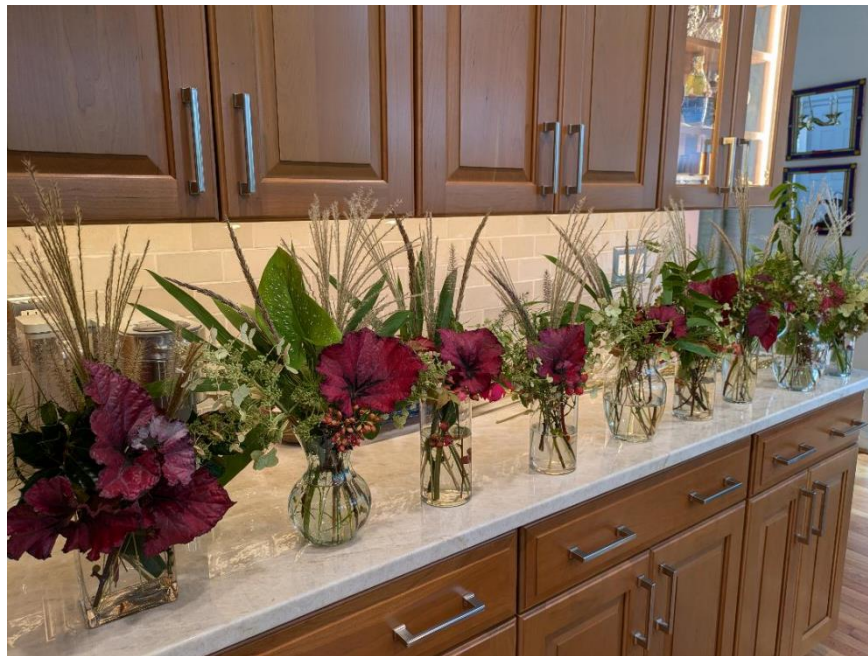
Flower arrangements, waiting for the 50 th celebration