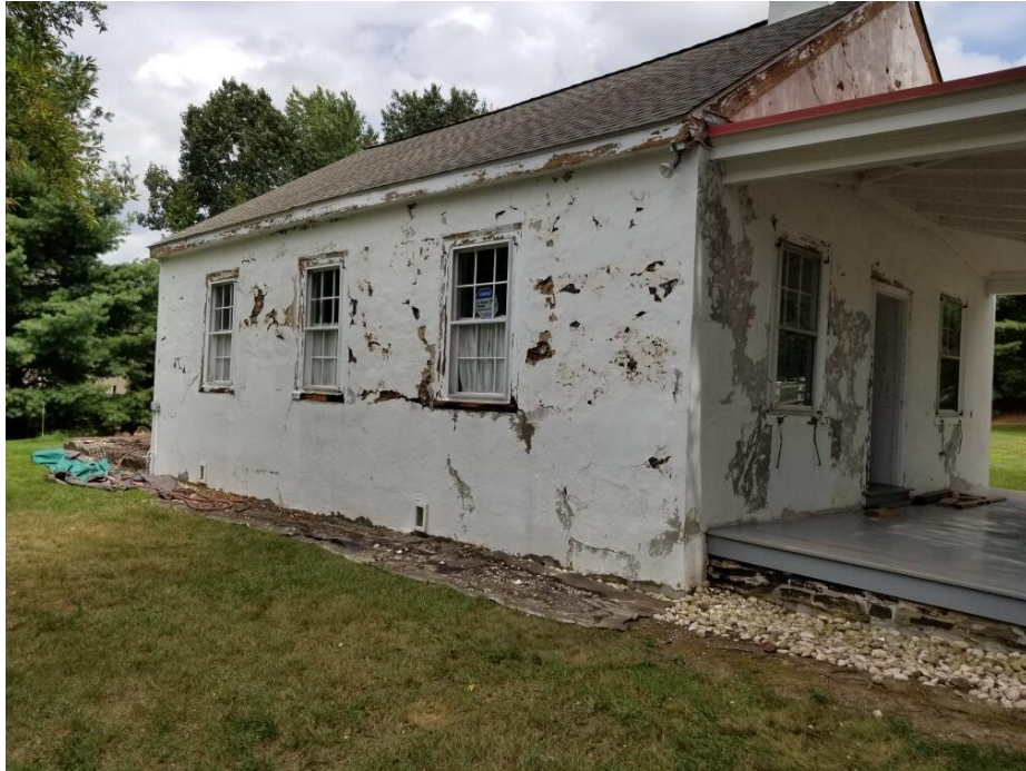
Starting the first round of patching the stucco (Sept 1)