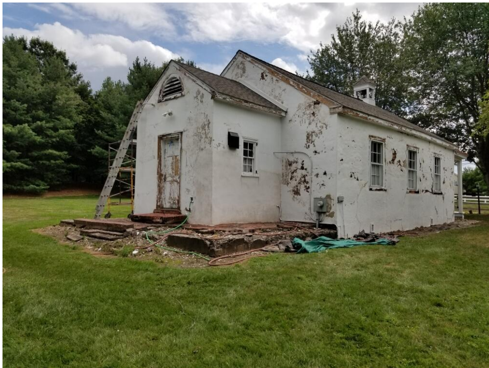
Joan Duxbury photo from September 1