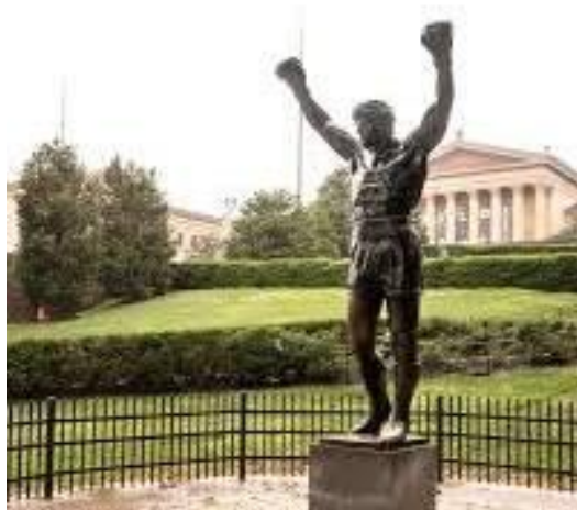
The Rocky Statue, soon the center of a special Philadelphia exhibition

2026 marks the 50 th anniversary of the first Rocky film. Using the Rocky statue as its centerpiece, the museum's special exhibit, opening in April, will examine issues important to historians: the role of public monuments, along with identity, power, memory, and community.