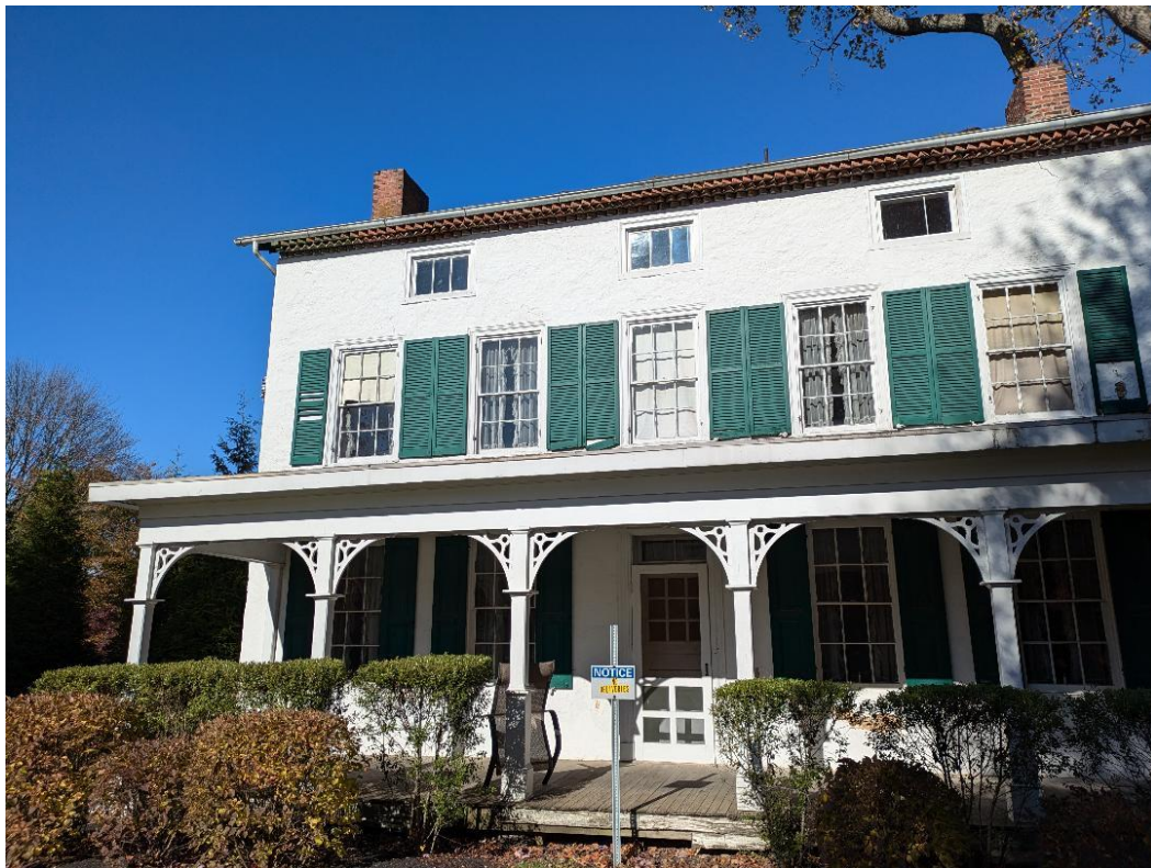
“Homiller House” at 781 Tennis Avenue (The small sign states, “No deliveries.”)