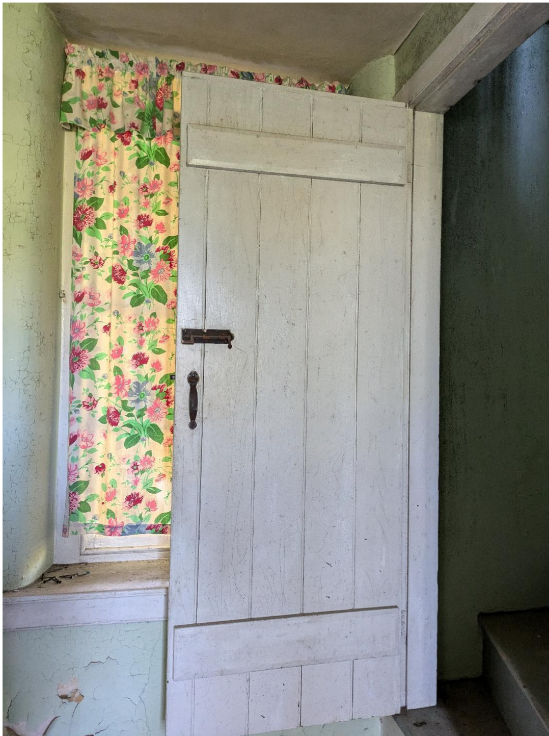
At the "Homiller House," the board-and-batten door, typical of houses built in 1830-1850, with its original hardware. Note the peeling paint in the lower left of the photograph.