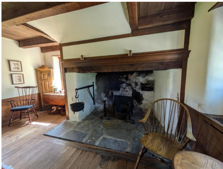
Walk-in fireplace at the “1704 Room,” Whitpain Farms

Planning Committee Needed for Fall Fund-raiser: WVHS is making arrangements to host an event at the historic Whitpain Farm's Manor House in the fall of 2026. If you are interested in serving on the planning committee, please let us know. This year, we will not be selling ads for a program book. To help, email to Info@WValleyHS.com .