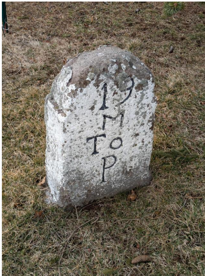
Colonial Milestone at St. John Lutheran Church, Skippack Pike, Blue Bell