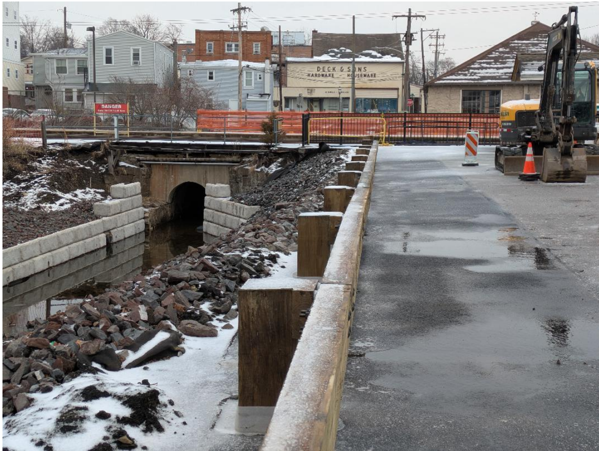
The Culvert at the Ambler Train Station, December 28, 2025

Helpers Wanted: WVHS needs help! Since the pandemic, we have been losing volunteers, and most of our group's responsibilities are completed by the board members. They need help! As part of the weekly "Volunteer Day," Thursday work sessions (or any time!), the board is looking for those who can assist to